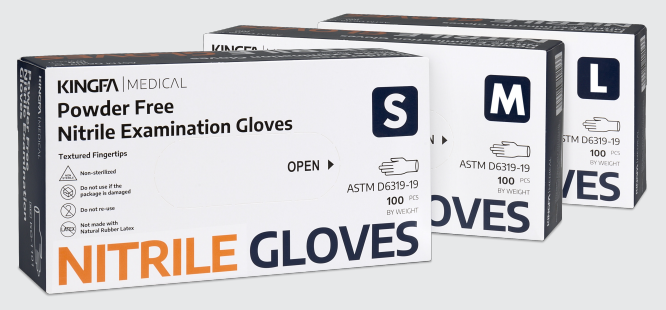
KG - 1101

To learn more, please visit: mainetti.com For all inquiries, please email: gloves@mainetti.com