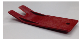
CS1PTOOL Plastic Crown Sizer Remover Tool